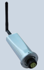
Data Logging Stick Wi-Fi