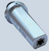
Data Logging Stick LAN