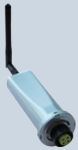
Data Logging Stick GPRS